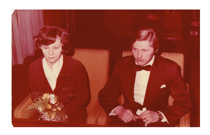
A wedding of Grandpa and Grandma

When Grandpa was 40 years old, he had to stop working because of serious illness. Despite this in 2008 he built the house on countryside with garden full of trees.