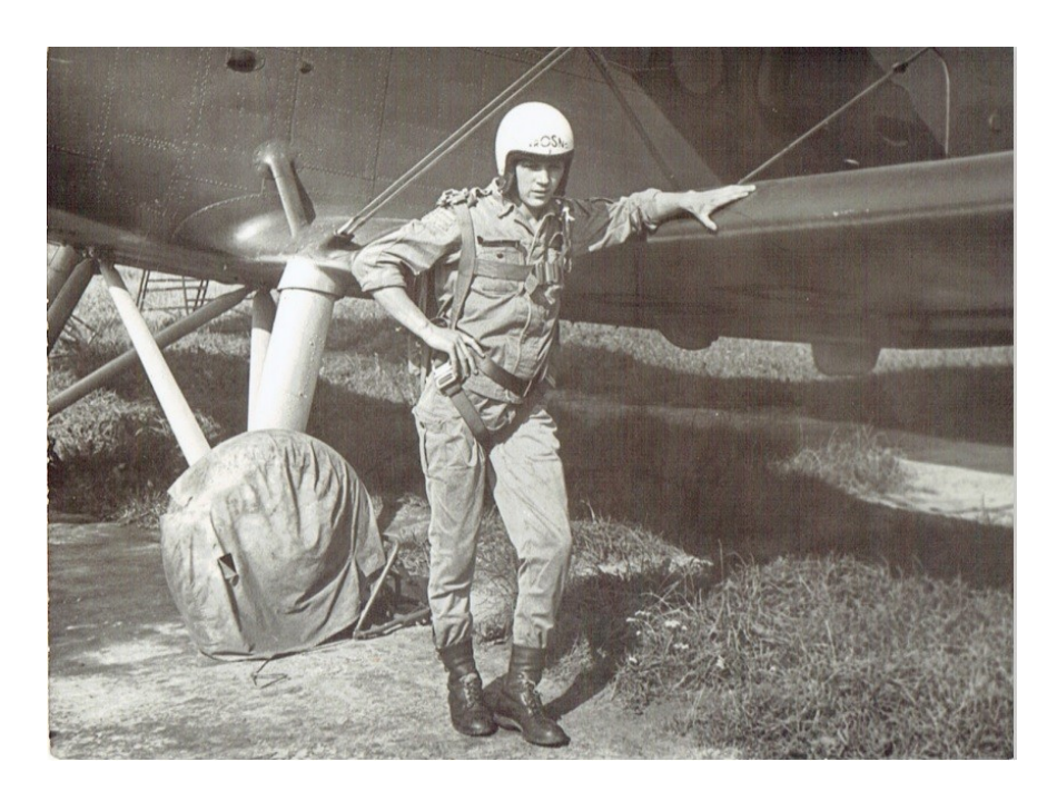
Grandpa as an airborne parachutists